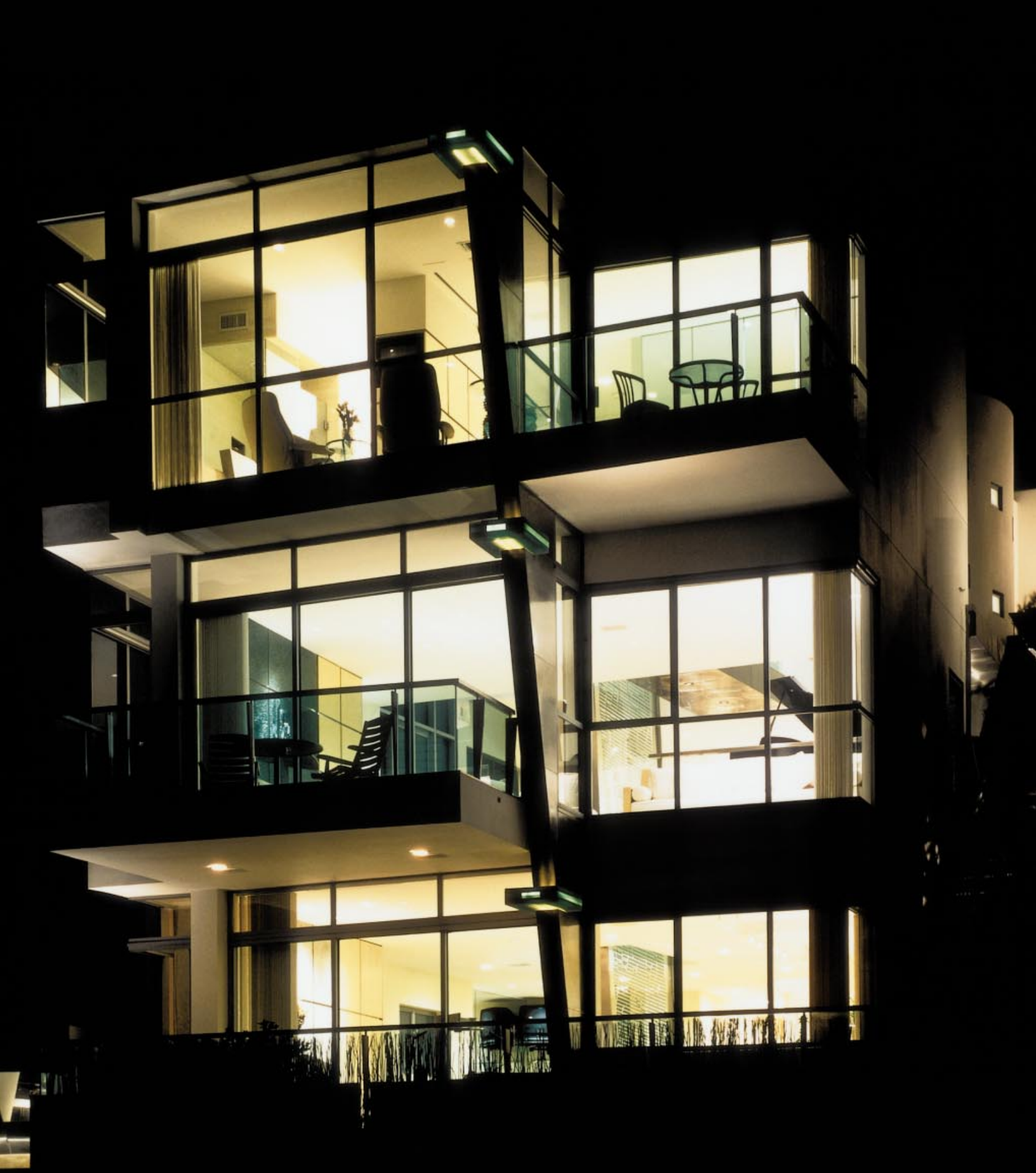
1212 The Strand, Manhattan Beach